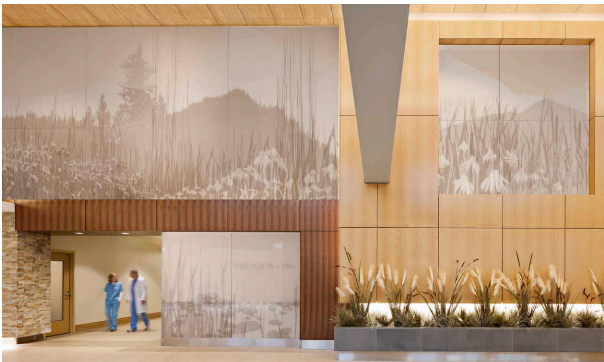
Baystate Health by Steffian Bradley Architects

Project Challenge: Create a calming environment that mirrors Baystate Health's re-engineered work flow in its new state-of-the-art facility in Springfield, Massachusetts. Balancing technology with nature in the 600,000-square-foot campus addition was important to support this hospital's rhythm for healing. Adhering to principles of The Green Guide for Health Care™, the facility incorporates eco-friendly materials and generous use of natural light throughout the hospital—especially in its five-story atrium at the building's core.