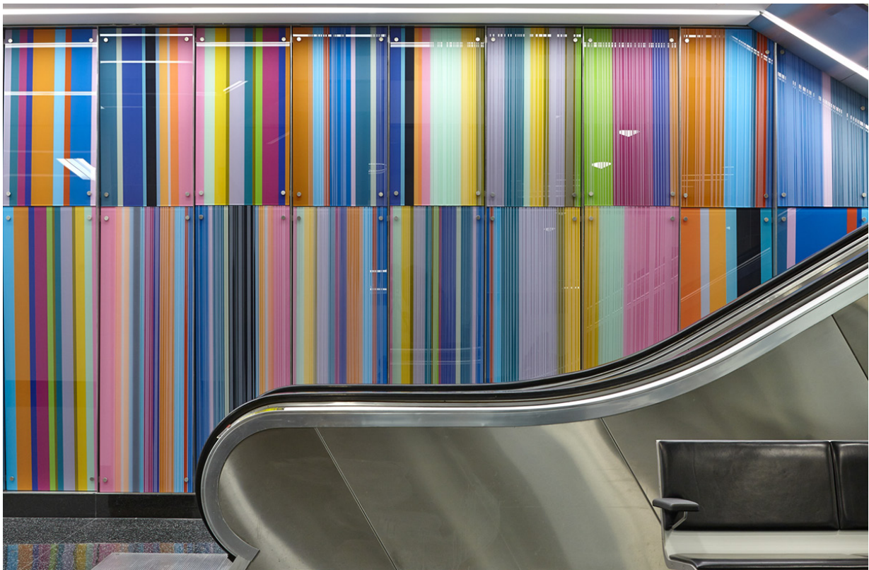
Richard Bolling Federal Building by Helix Architecture